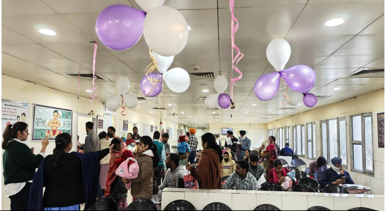
Health Talk in Paediatrics Department