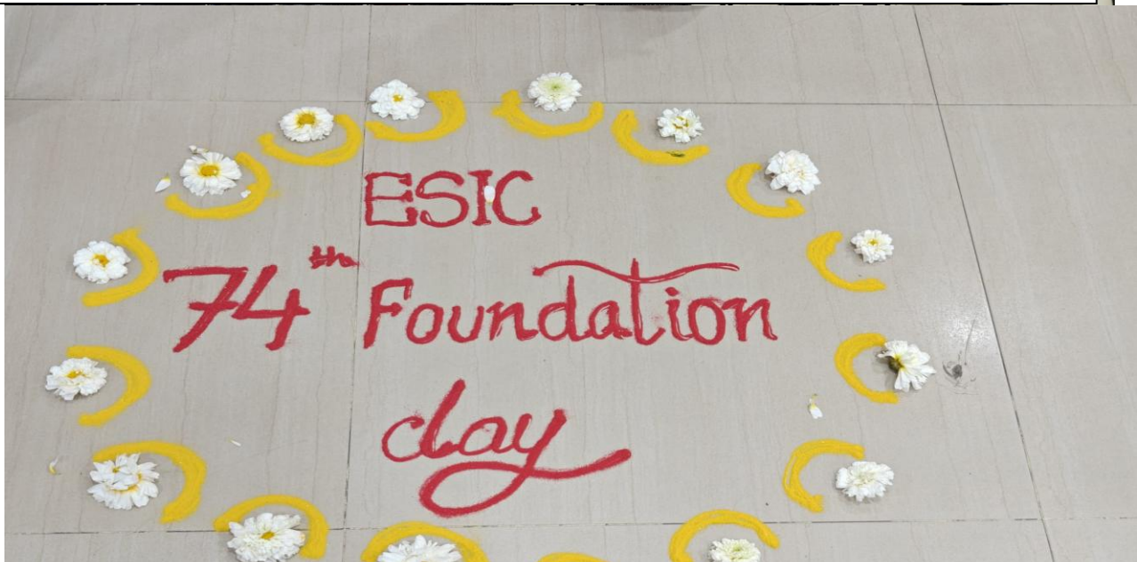
ESIC Foundation Day Rangoli

74वें ईएसआईसी स्थापना दिवस और विशेष सेवा पखवाड़ा (24.02.2025 – 09.03.2025)