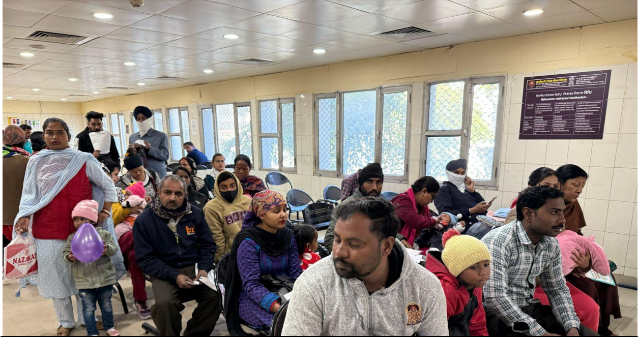
Health Talk in Paediatrics Department